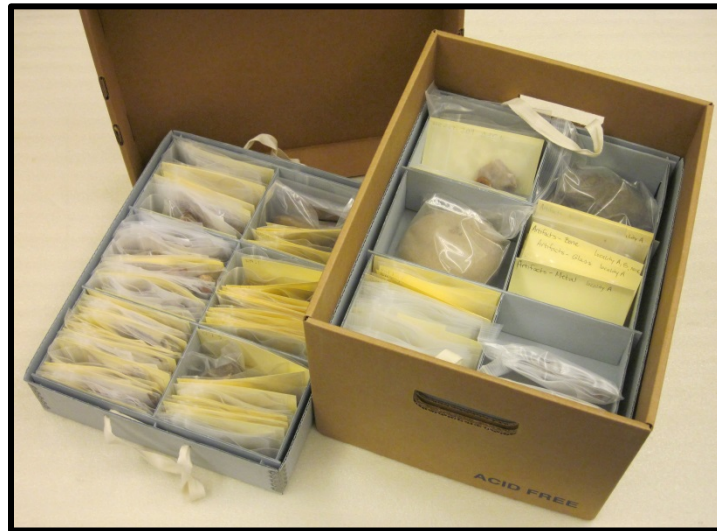
A collection prepared by Burke staff. All specimens are housed in archival bags, trays, and a bankers box. Distinct material types are separate by archival card stock labeled in pencil.

Materials from distinct sites should be housed in distinct boxes. Finished boxes should weigh no more than 30 pounds, including contents.