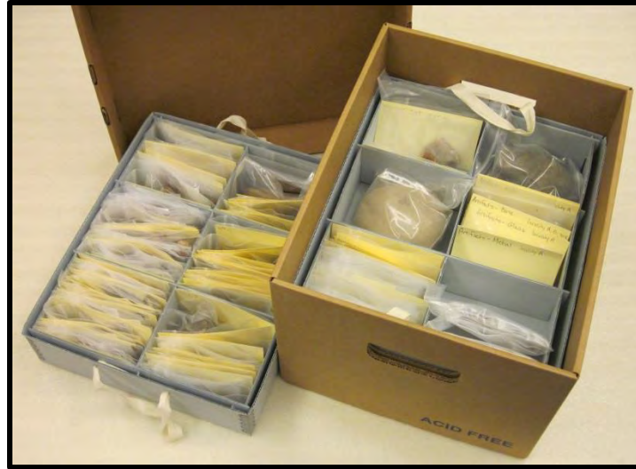
A collection prepared by Burke staff. All specimens are housed in archival bags, trays, and a bankers box. Distinct material types are separate by archival card stock labeled in pencil.

Materials from distinct sites should be housed in distinct boxes. Finished boxes should weigh no more than 30 pounds, including contents.