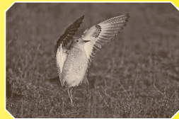
"Buff-breasted Sandpiper"

The Burke Museum and the King County Library System make learning a joy.