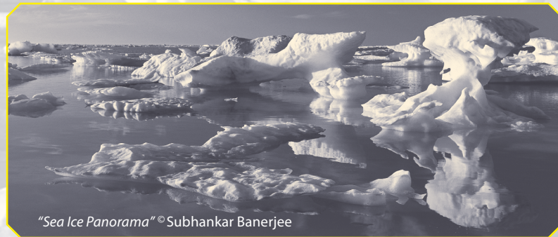
“Sea Ice Panorama” © Subhankar Banerjee

US Fish & Wildlife Service, http://arctic.fws.gov/