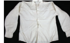
Boy's white shirt