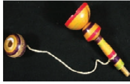
Cup and ball game