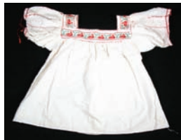
Embroidered cotton blouse