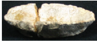
Corn dish model