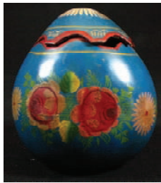
Painted gourd bowl with lid