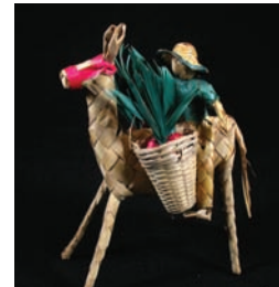
Straw burro and man