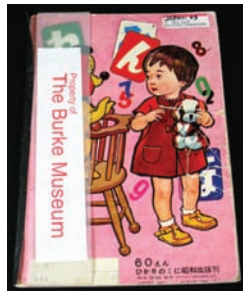
Japanese writing characters