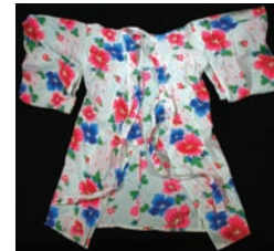
Yukata (Summer kimono)