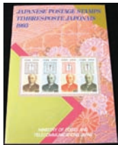
Book: Japanese Postage Stamps/Timbres-Postes Japonais 1995