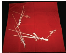
Furoshiki (Shopping wrap)