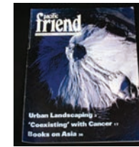
Magazines (3): Pacific Friend