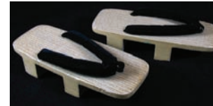
Getas (Elevated sandals) (2)