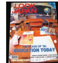
Magazine: Look Japan