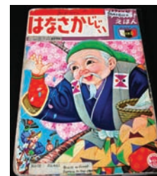
Japanese language storybook