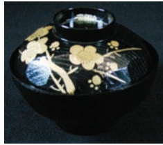
Soup bowl with lid