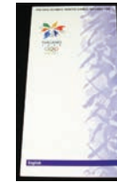
Bochure: Nagano 1998