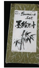
Sumi (writing) set