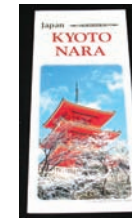
Brochures (4): Osaka/Kobe, Kyoto/Nara, Tokyo, Fuji