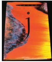
Book: Japan: Profile of a Nation