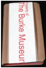
Basic conversation dictionary