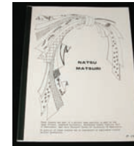
Book: Natsu Matsuri