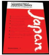
Book: A Chronological Outline of Japanese History