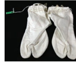
Tabi (Toe socks) (2)